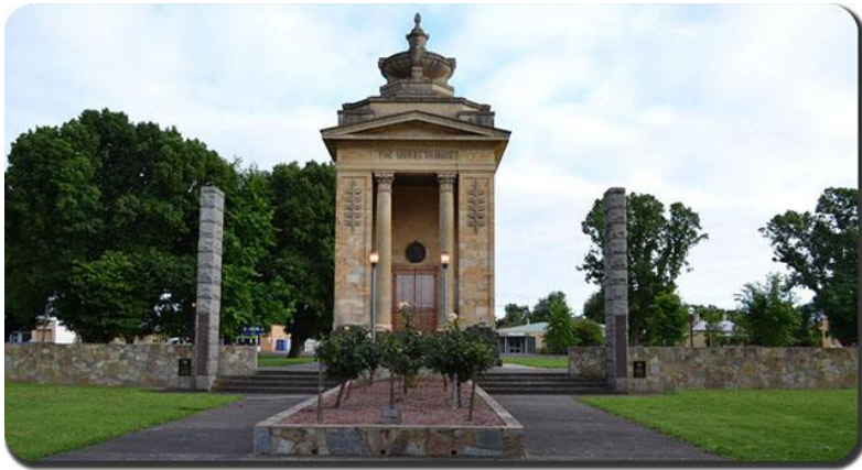
Colac War Memorial